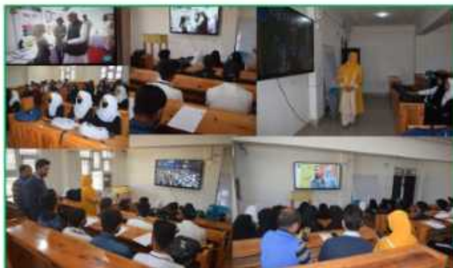
Pariksha Pe Charcha with PM