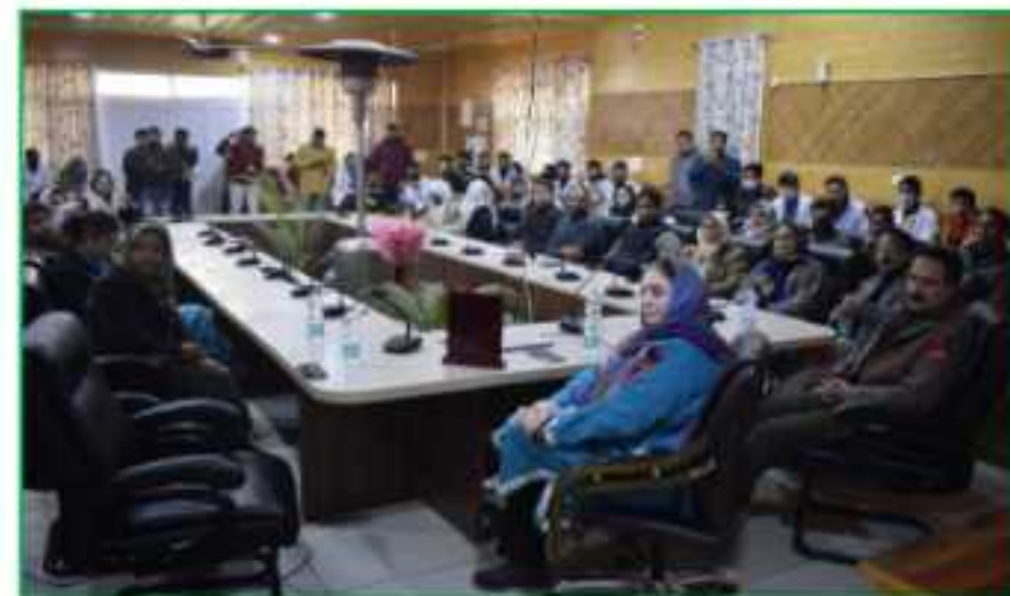
World AIDS Day