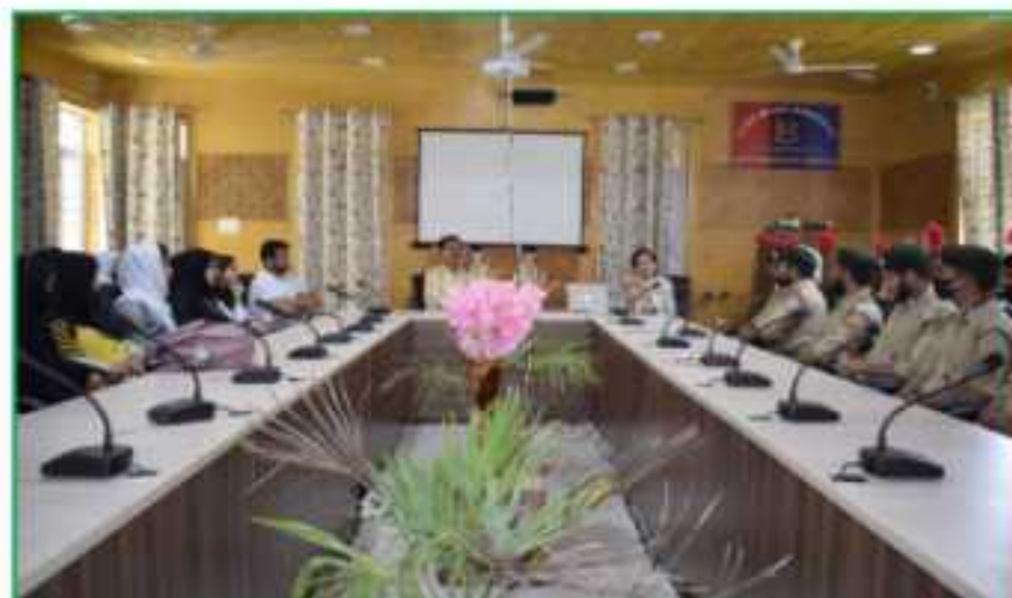
World Environment Day