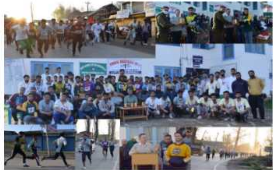
College Road Race