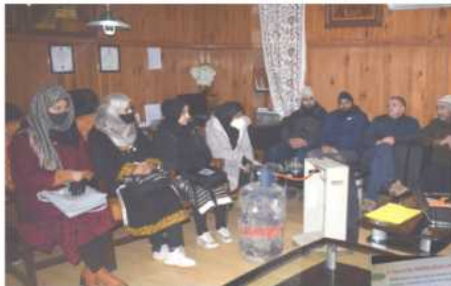
Cyber Jagrukta Divas