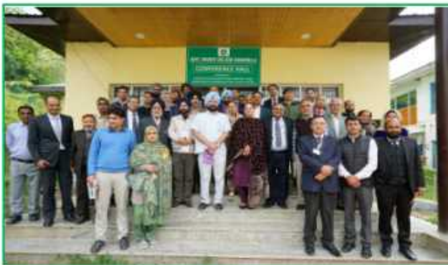
UGC Autonomous Team Visit