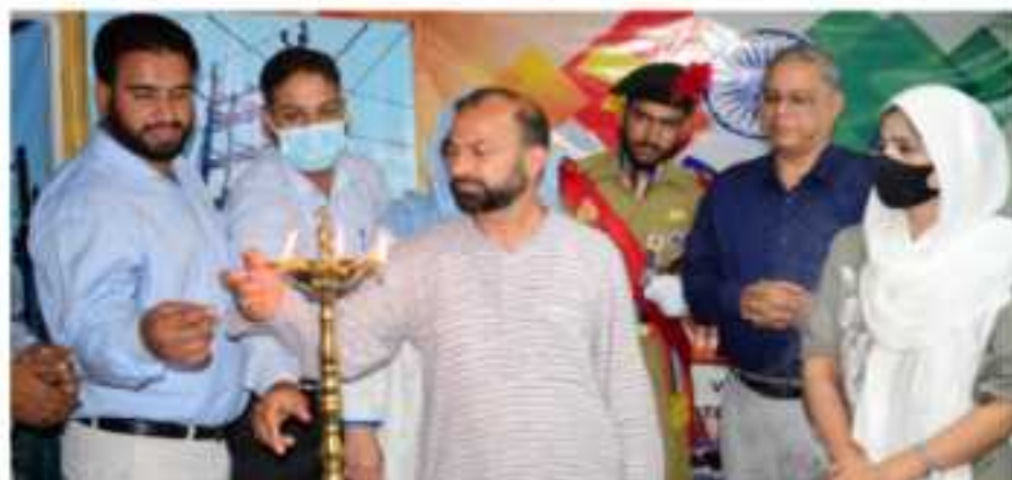
Ujjwal Bharat Ujjwal Bhavishya