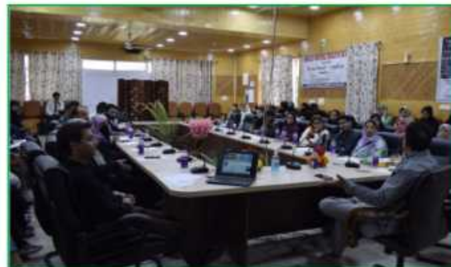
Mental Health Week Celebration