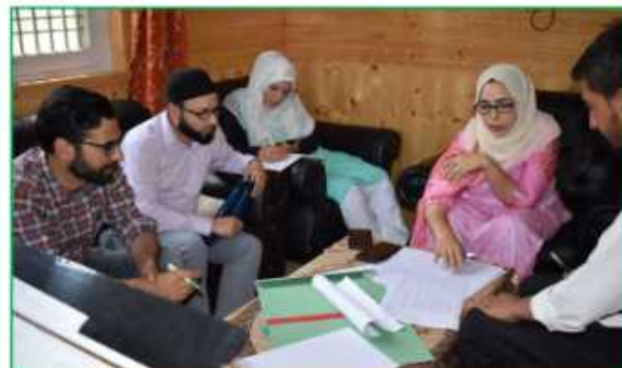
Student Induction Programme