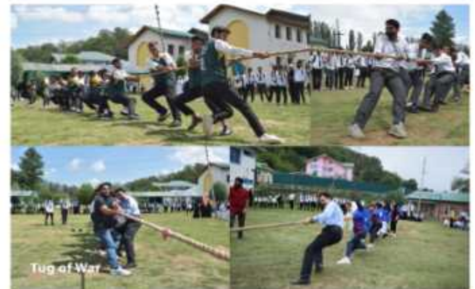
Tug of War