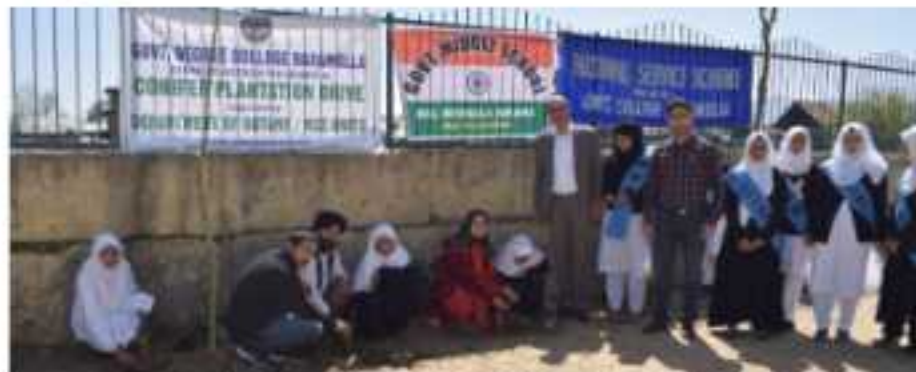
Conifer Plantation Drive by NSS at GMS Johama