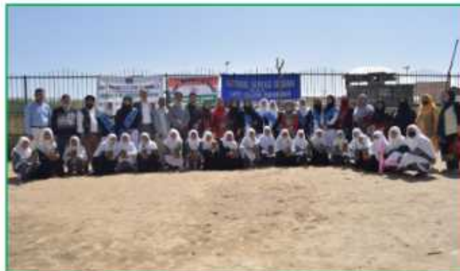
Conifer Plantation Drive at GMS Jahama