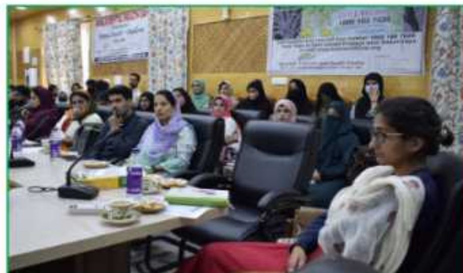
World Mental Health Day