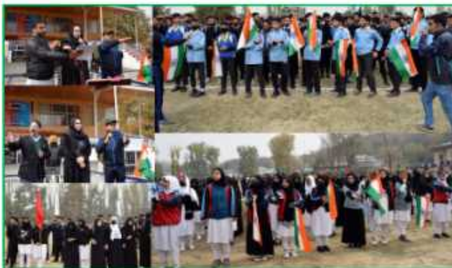
Pledge Against Substance Use